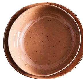
Sandia in Speckled Terracotta Melamine Fortessa Tableware Solutions food52.com

This classic and sophisticated marble pattern in melamine is great to mix and match.