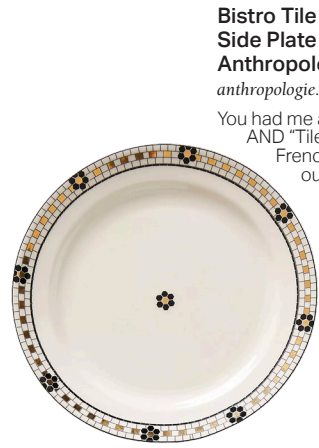
Bistro Tile Side Plate Anthropologie anthropologie.com You had me at "Bistro" AND "Tile"! So French, so chic, oui oui ou!!!!

Classic Dinner Party or Netflix for Two? Netflix for Two . Serve Yourself Buffet or Attentive Waiters? Attentive Waiters . Top Chef or Takeout? Top Chef . Curated Wine Pairing or BYOB? BYOB . Cozy Corner Booth or Airy Outdoor Café? Airy Outdoor Café .