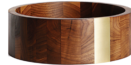
Wooden Palate Mod Bowl Garde gardeshop.com

Since I now divide my time between New York and Los Angeles, I have found wonderful new sources on the West Coast for great design. This reclaimed, recycled, repurposed wooden bowl is another find from Garde. It is just stunning.