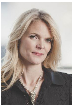
Principal BUTTER & EGGS INTERIORS butterandeggs.com

Stay At Home or Hit the Town? Hit the town! Make Reservations or Make a Meal? I used to make reservations, but quarantine has inspired me to cook. Vegan, Vegetarian, Omnivore or Carnivore? Omnivore with carnivorous leanings. Tray Tables or Table for Two? Table for two. Dishwasher or Sink? Dishwasher. Candlelight Dinners or Sunday Brunch? Sunday brunch.