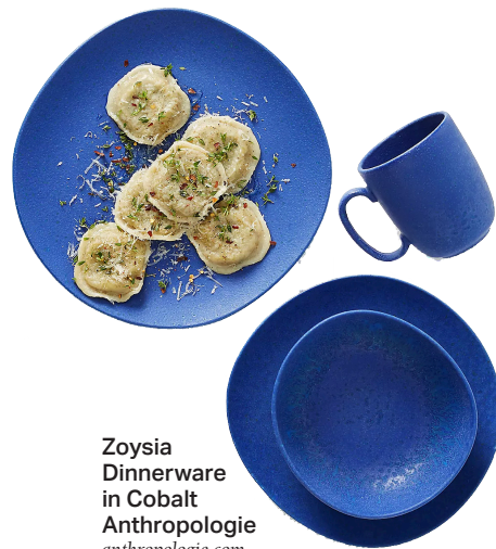
Zoysia Dinnerware in Cobalt Anthropologie anthropologie.com

Beautifully saturated color and has a Russel Wright vibe that I love.