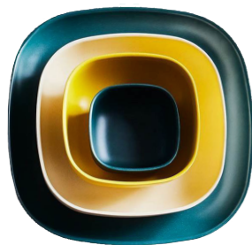
Recycled Bamboo Rainbow Place Setting EKOBO food52.com

Stay At Home or Hit the Town? Hit the town! Make Reservations or Make a Meal? I used to make reservations, but quarantine has inspired me to cook. Vegan, Vegetarian, Omnivore or Carnivore? Omnivore with carnivorous leanings. Tray Tables or Table for Two? Table for two. Dishwasher or Sink? Dishwasher. Candlelight Dinners or Sunday Brunch? Sunday brunch.