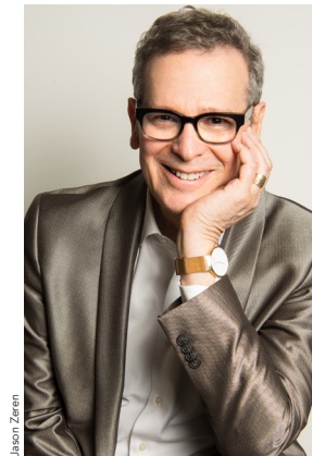
Principal GORALNICK ARCHITECTURE DESIGN STUDIO barrygoralnick.com