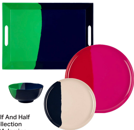
Half And Half Collection in Melamine Thomas Fuchs Creative thomasfuchscreative.com

Love these fashion forward color combinations (especially fuchsia/red which appeared on every red carpet during awards show season). The crisp, clean design makes a great starting point for a summer table.