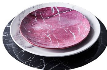
Palace Marble Design Red, Black + White Fortessa Tableware Solutions food52.com

The perfect palette and silhouette for a midcentury modern summer table.