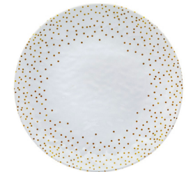
Alora Glam plates Godinger godinger.com

These Alora Glam plates by Godinger are melamine. The simple white and gold pattern feels at home mixed in on a formal table or as the perfect plate at a lobster bake on the beach.