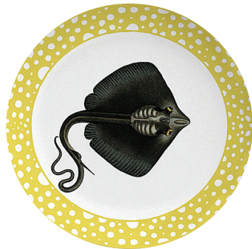
Stingray Shark Melamine Dinner Plate etsy.com/shop/TheRekindledPage This shop has some fun designs to choose from!