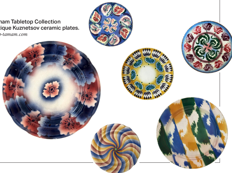
Tamam Tabletop Collection Antique Kuznetsov ceramic plates. shop-tamam.com

TAMAM is the Turkish word for "ok, sure, alright, uh-huh, yep." It also comes from the Arabic root word for "complete," which felt right to Hewitt and Frost when they stumbled upon the space for Tamam.